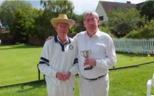
The 4 semi-finalists were invited to the regional round held at Watford on 30 July.