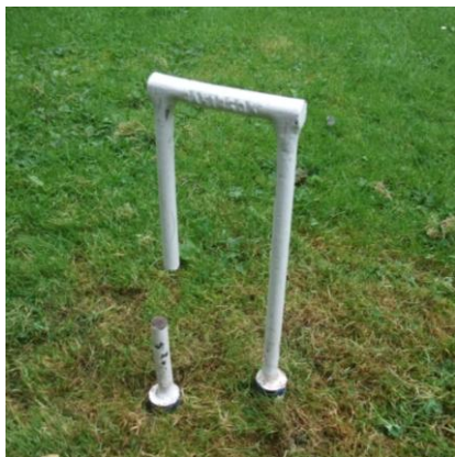
Figure 1 The broken hoop

Hoops are made of cast iron because they are cheap to reproduce, albeit a glance at the Jacques catalogue would belie that fact. Cast Iron differs from steel in that it has much more carbon in it approx 4% rather than 1%. It comes in half a dozen different metallurgical states - our hoop is most likely grey cast iron the most common form. When cast iron fails it will not deform in a noticeable way and appears to snap apart, like a biscuit [provided you haven't dunked the biscuit]. This makes it sensitive to defects and impurities many of which arise during a simple casting process. One common defect is porosity caused by small gas bubbles forming in the molten metal during casting and then trapped as the metal cools and